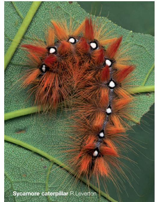
Sycamore caterpillar R.Leverton