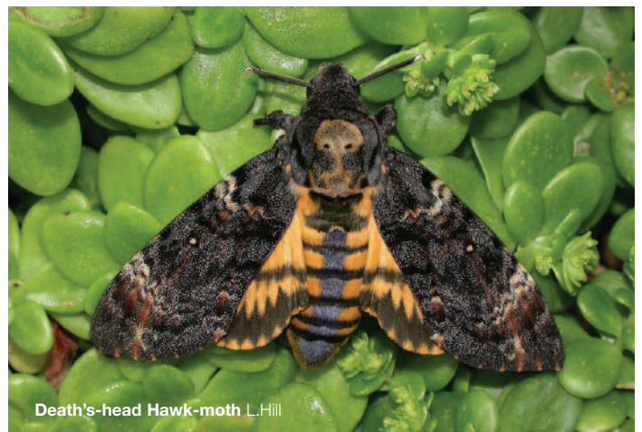
Death's-head Hawk-moth L.Hill