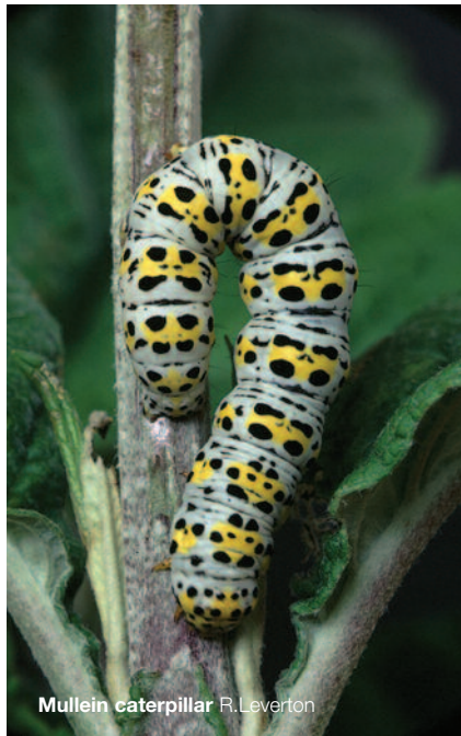
Mullein caterpillar R.Leverton