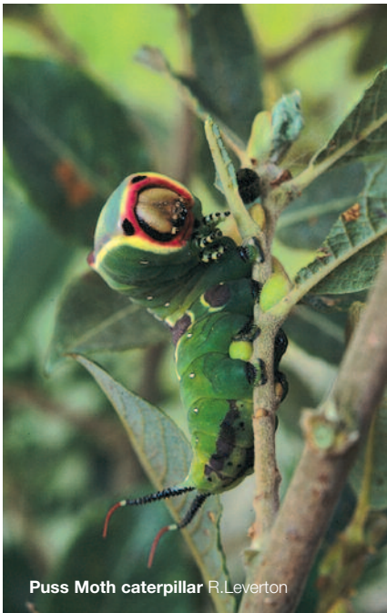
Puss Moth caterpillar R.Leverton